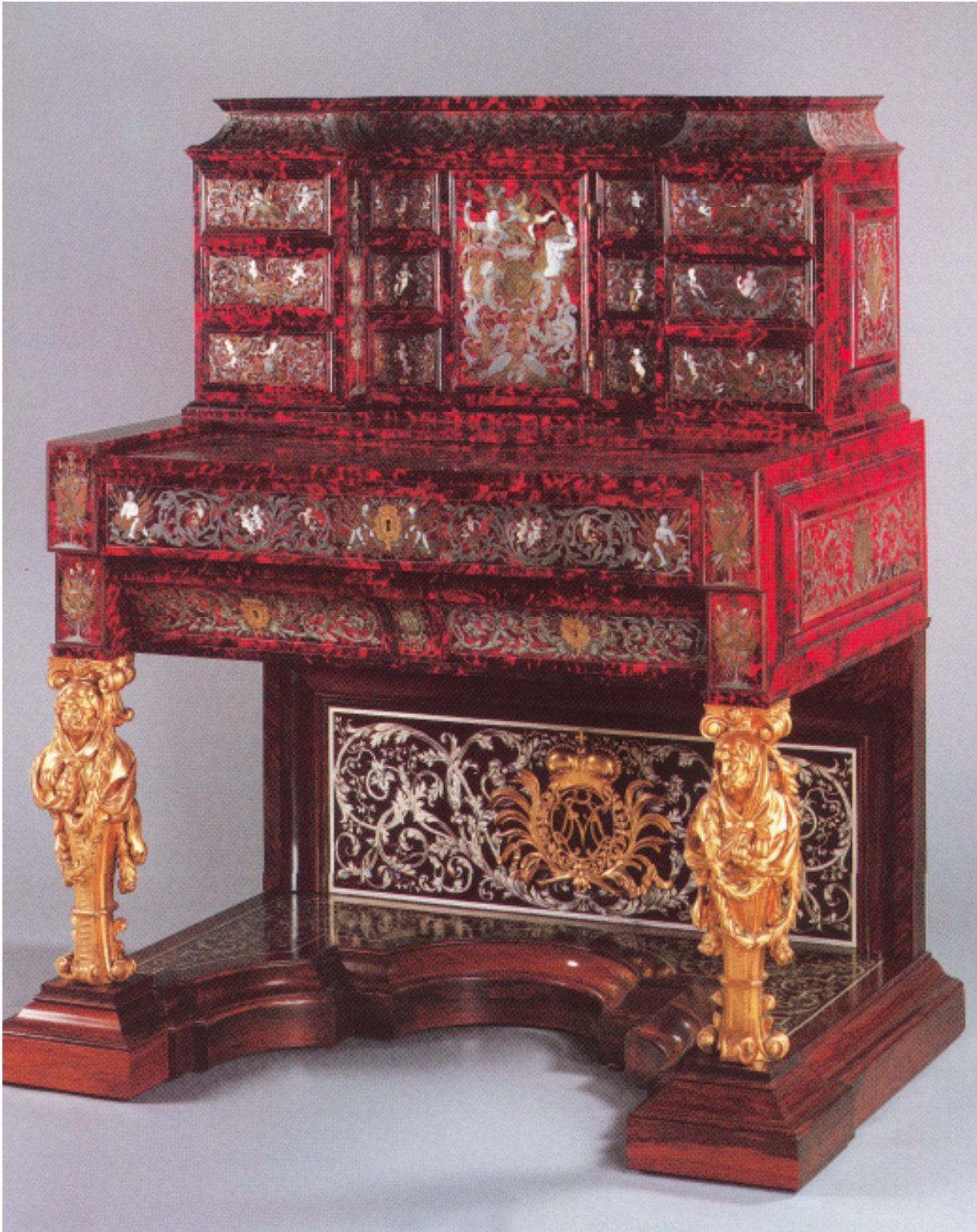
Boulle desk with the monogram 'ME' for Max Emanuel of Bavaria, father of Clemens August of Bavaria, and with the electoral crown above the monogram and on the key escutcheons. Antwerp, c. 1700.