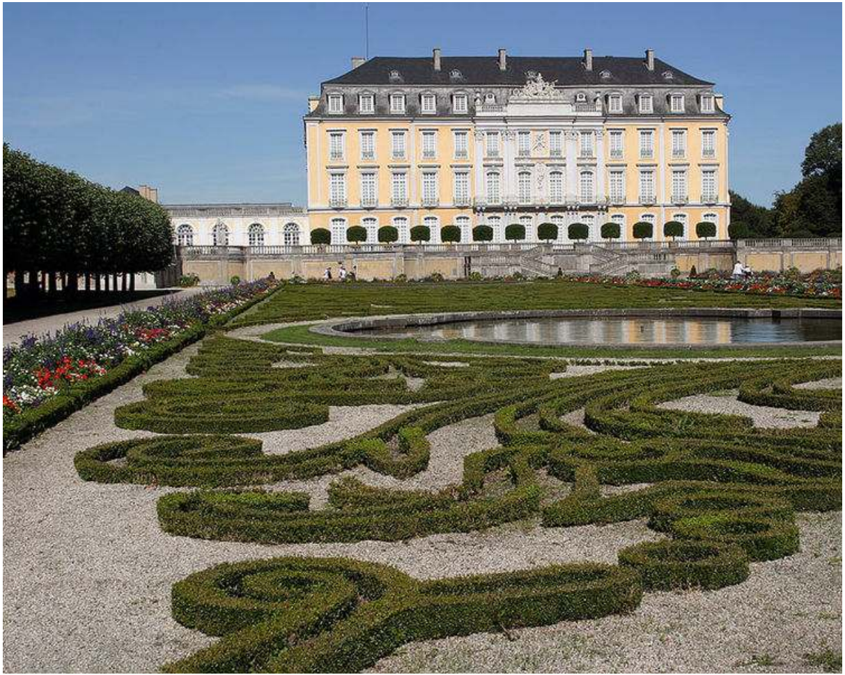
Schloss Brühl, near Bonn, Germany. Built by Clemens August I of Bavaria at the beginning of the 18 th century.

The japanned cabinet was in the Indian room, which was destroyed during the Second World War, only fragments of the panelling remaining.