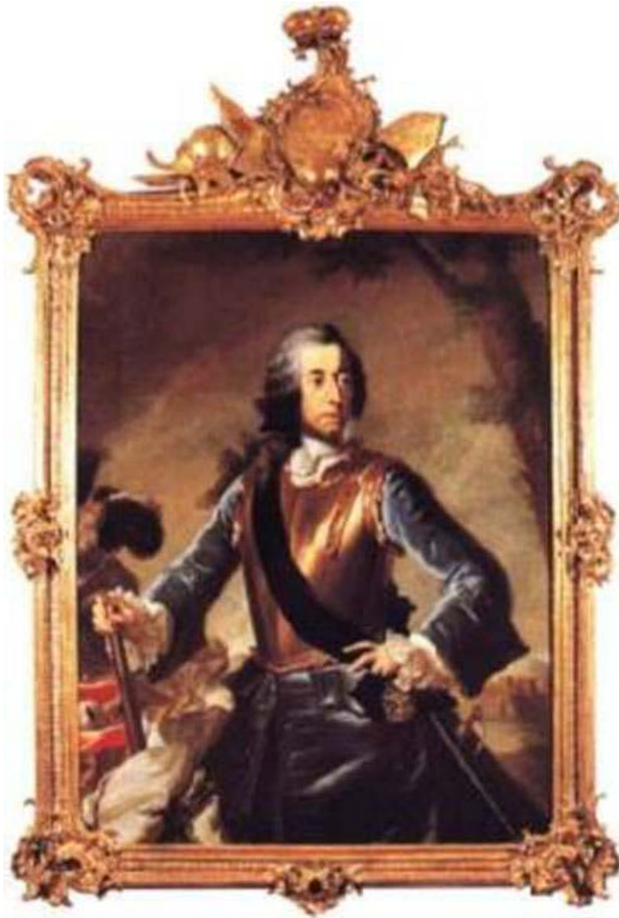
Clemens August of Bavaria (1700-1761), Archbishop-Elector of Köln.