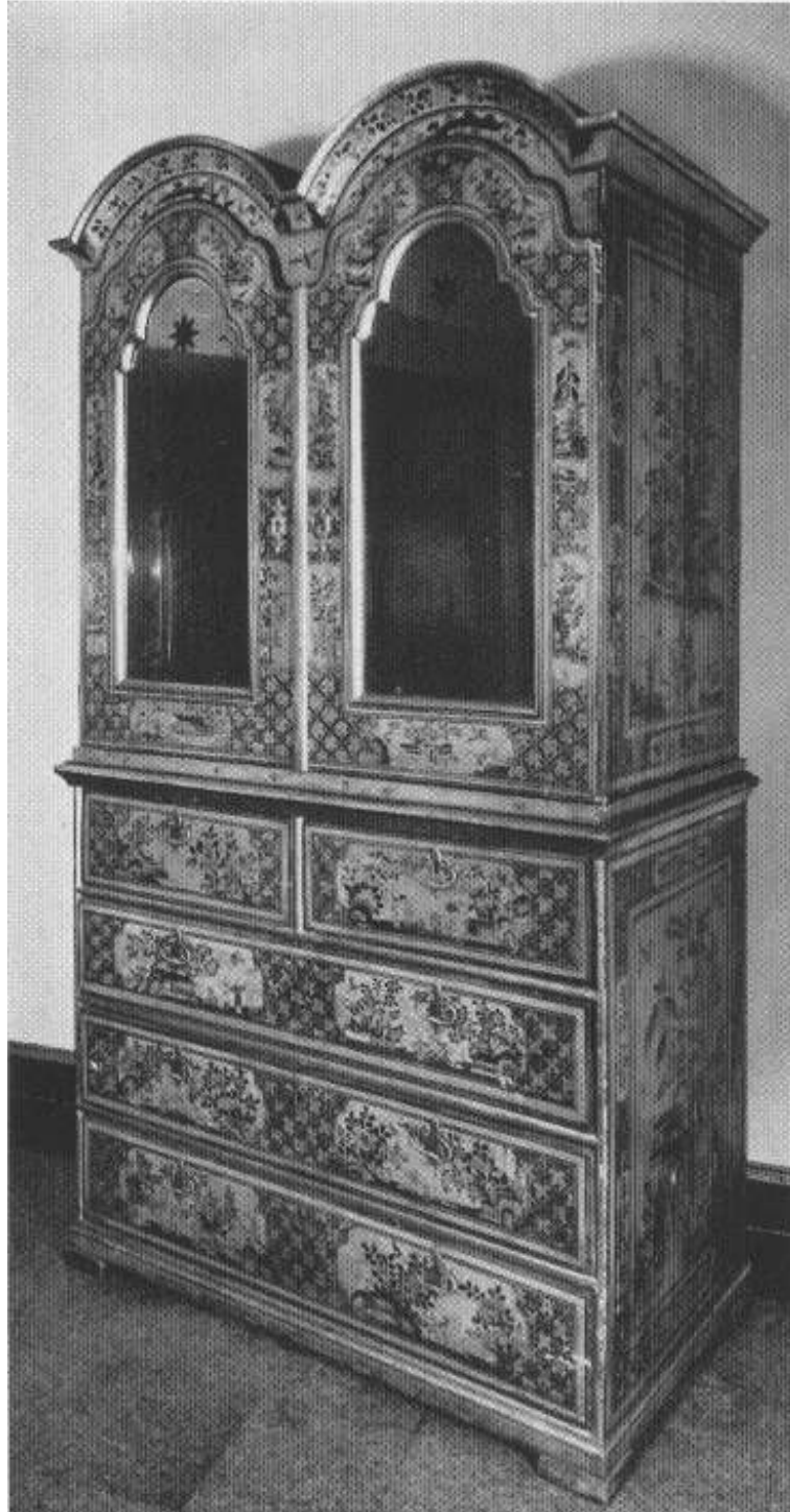
German green-japaned cabinet with related unusual background to the reserves. Hamburg, c. 1730. The decoration possibly by Albrecht Hieronymus Haas.

Nasjonalmuseet, Oslo (Inv. No. OK 6561). The cabinet was acquired by the museum in 1901.