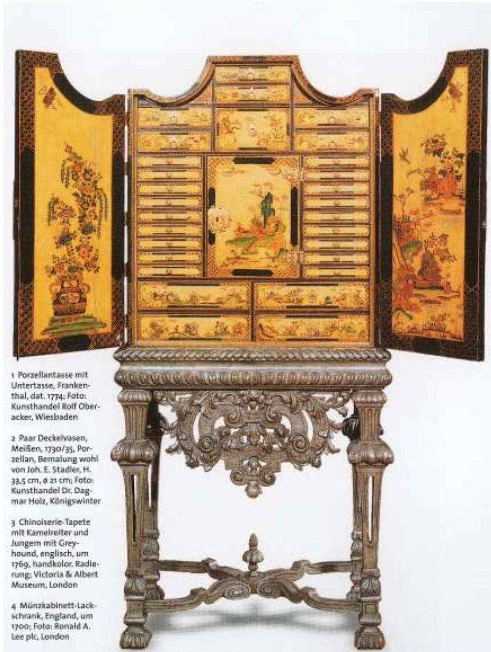
1 Porzellantasse mit Untertasse, Frankenthal, dat. 1774; Foto: Kunsthandel Rolf Oberacker, Wiesbaden