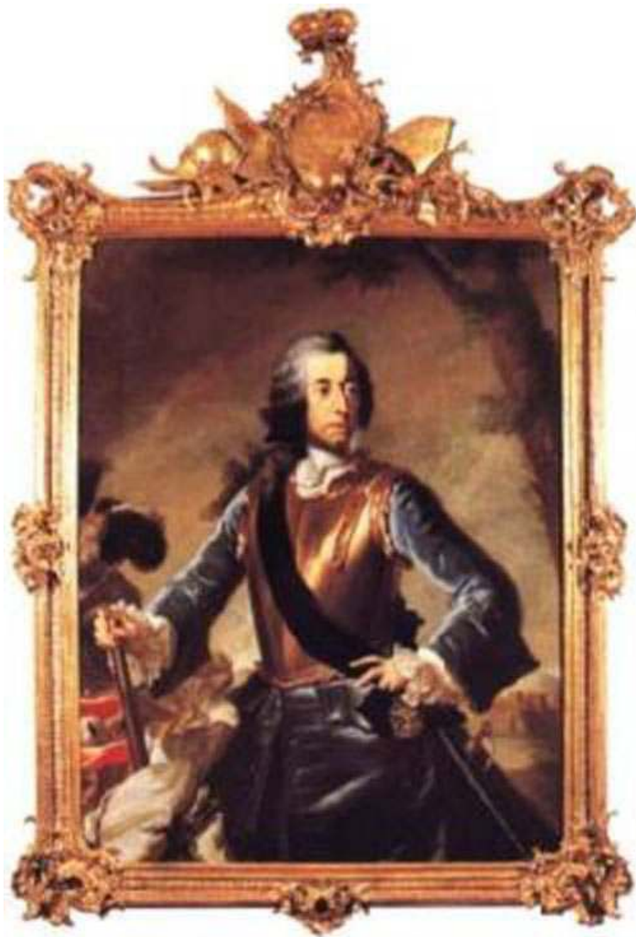
Clemens August of Bavaria (1700-1761), Archbishop-Elector of Köln.