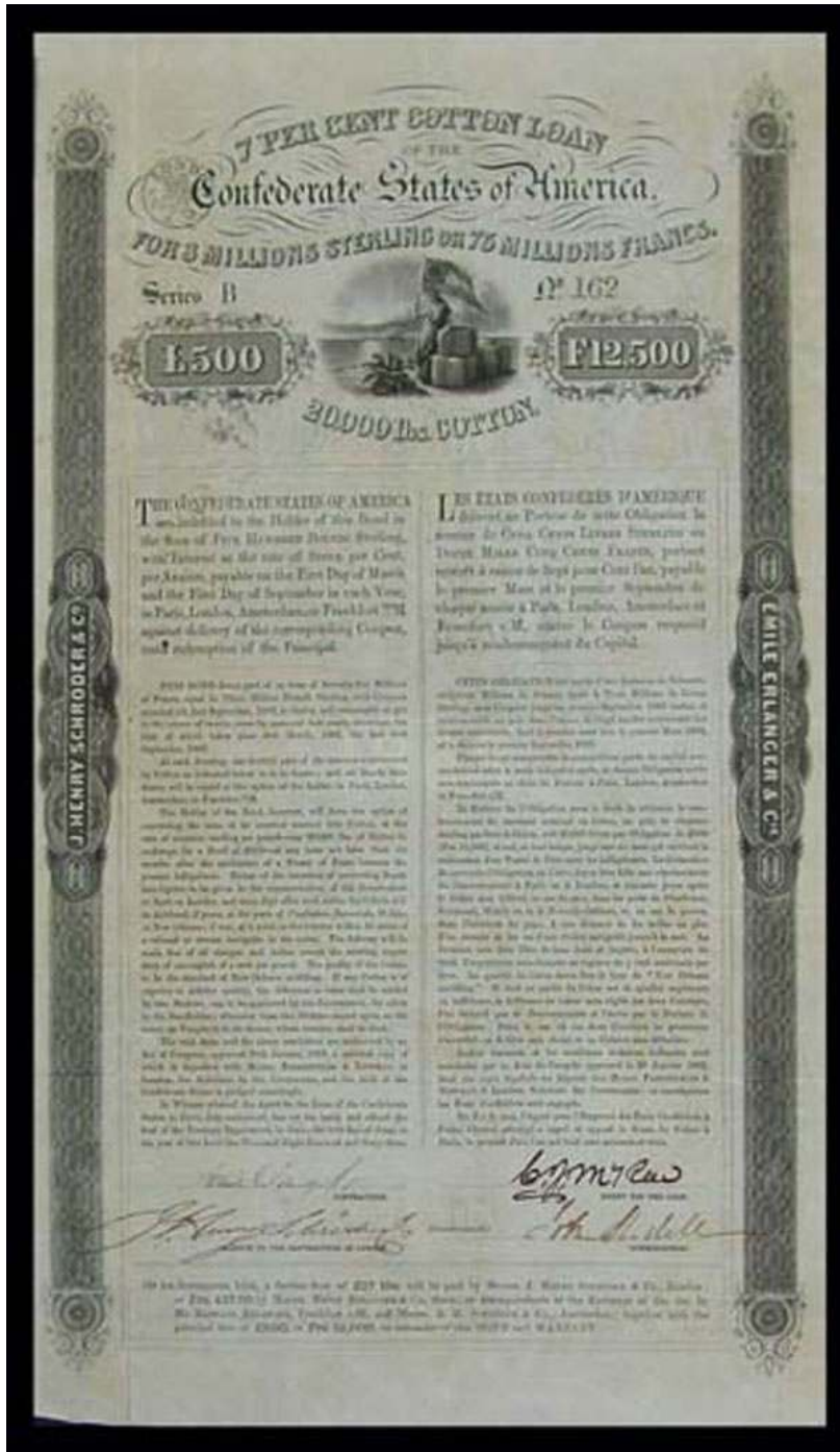
Cotton Loan of the Confederate States of America, signed by Emile Erlanger, grandfather of Rudolf and instigator of the 'Erlanger Loan' of 1863, when he lent the Confederacy $15,000,000 by underwriting bonds secured by cotton.