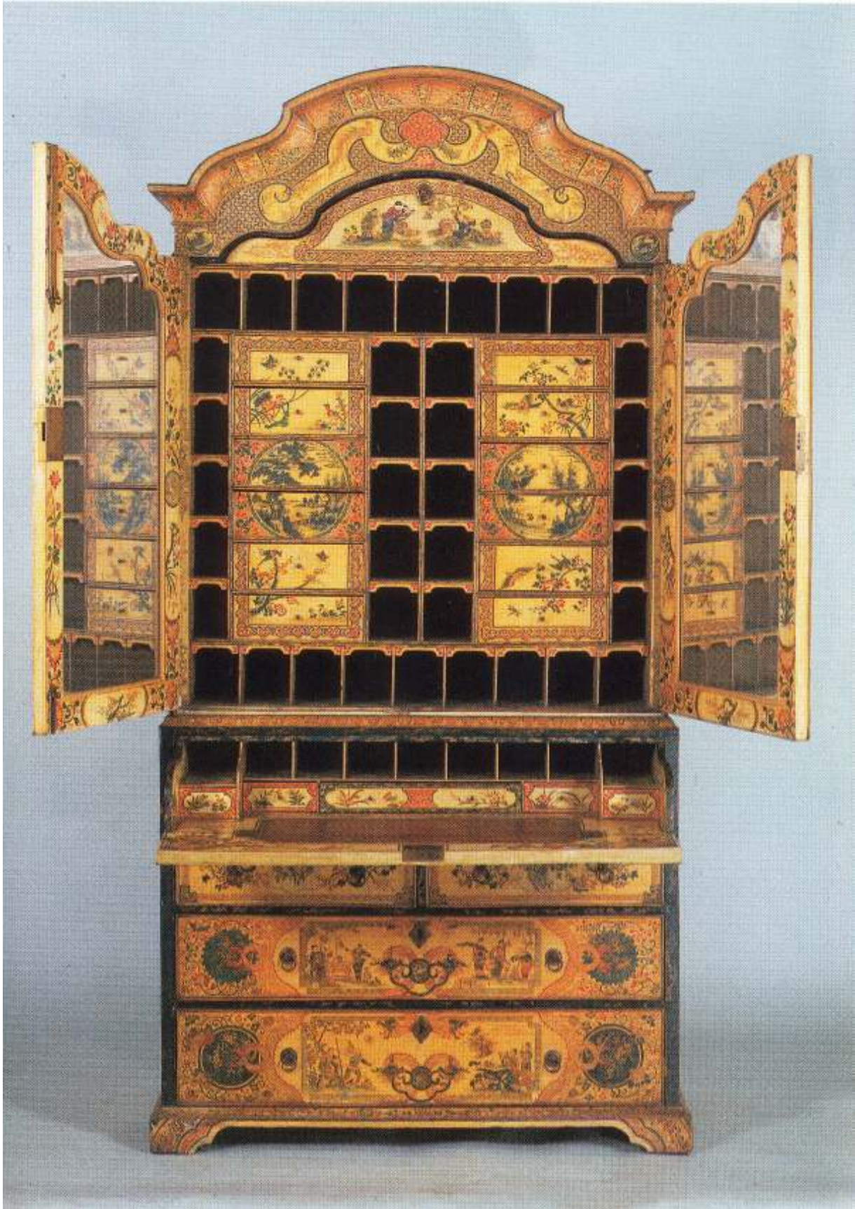
Jappaned cabinet with doors open.