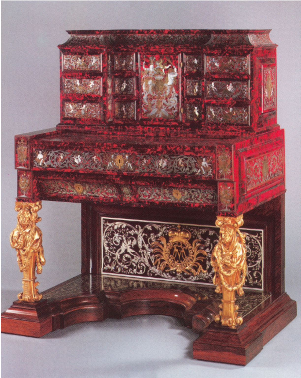
Boulle desk with the monogram 'ME' for Max Emanuel of Bavaria, father of Clemens August of Bavaria, and with the electoral crown above the monogram and on the key escutcheons. Antwerp, c. 1700.